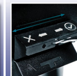
Burn Pot Agitator