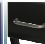
Heavy Duty Handles