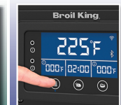
Digital Control Display with Smart-Touch System