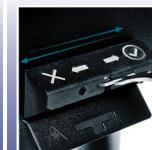
Burn Pot Agitator