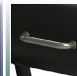
Heavy Duty Handles